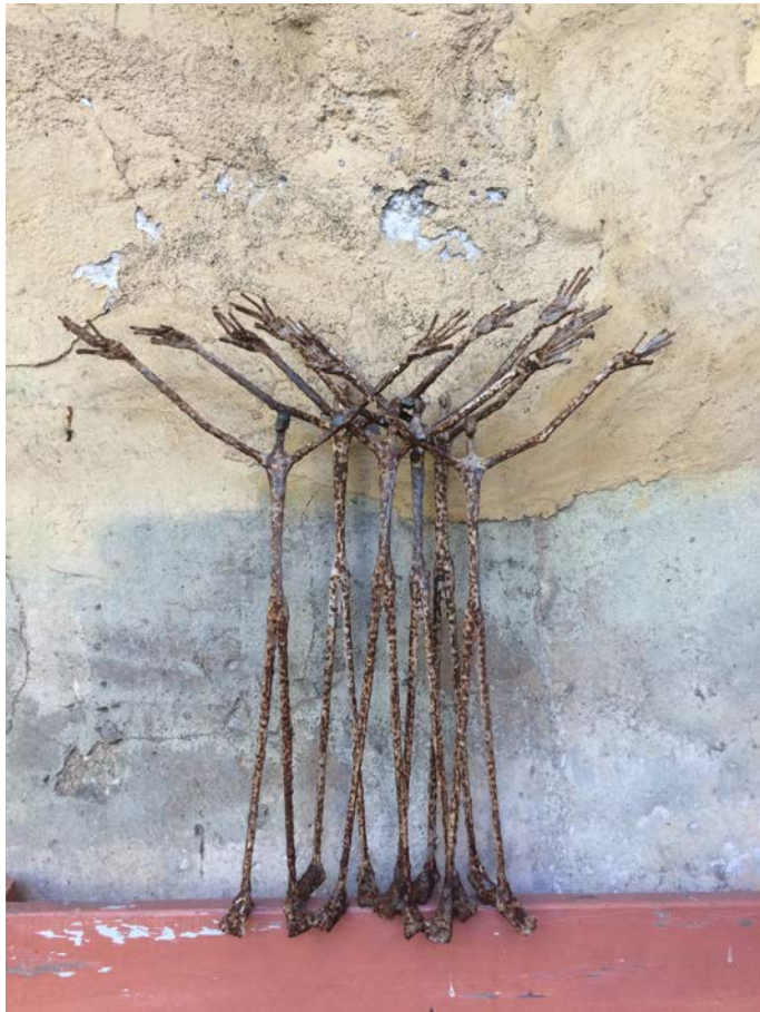
Hope. 2011 Welded steel | H57 x L50 x D20 cm © Sitor Senghor