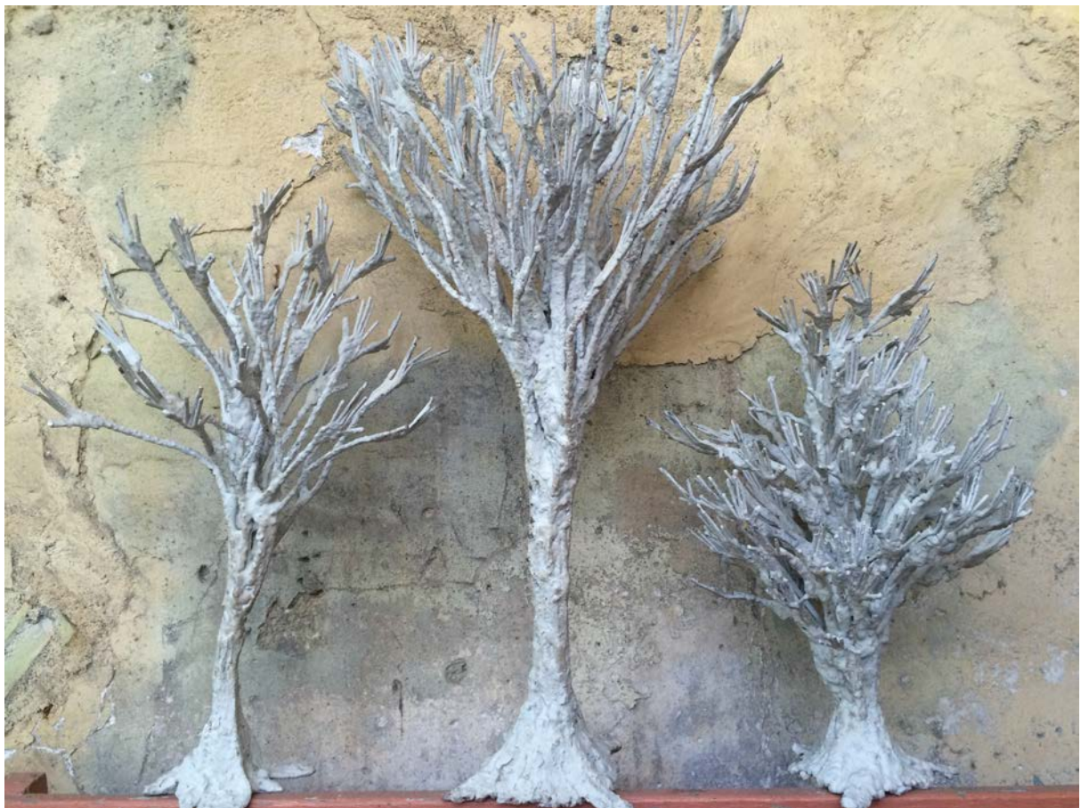
Trees of the origin. 2013-14 Welded steel | H30-55 cm © Sitor Senghor

Emblem of Senegal and omnipresent in the African collective imagination, the tree is the essential symbol of life, nature and wisdom. Giacometti and numerous modern artists were influenced by African sculpture starting from the 20s. It is now Ndary's turn to appropriate this cultural heritage and to present his own lanky and slender image in his Trees of Origins . His humanized vegetal compositions, where man draws all of his energy from the very roots of nature, are warning calls for more commitment and responsibility towards the material and spiritual environment.