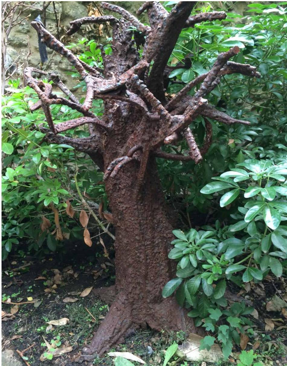
Tree of the origin. 2013-14 Welded steel | H106 x L80 x P80 cm © Sitor Senghor