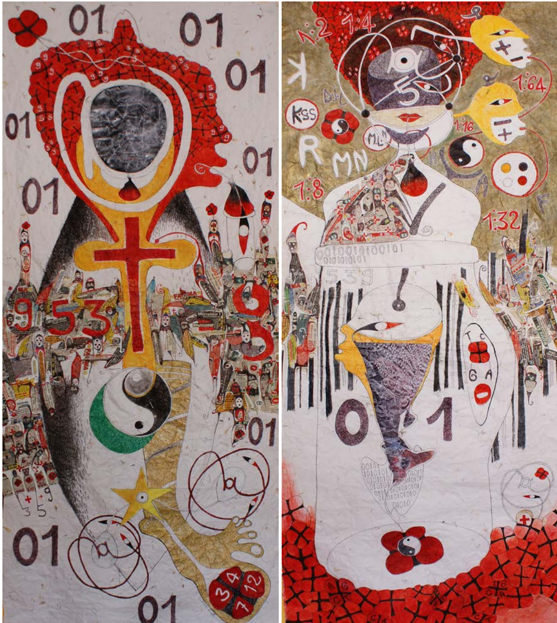
Akiineh @ t'as vu silence silence silence. 2012.