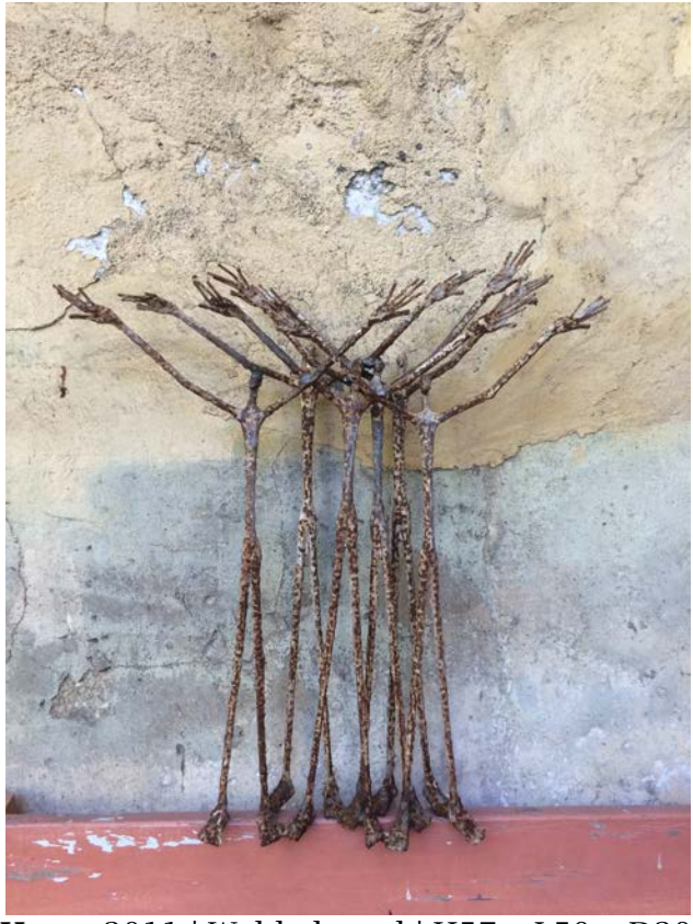
Hope . 2011 | Welded steel | H57 x L50 x D20 cm | © Sitor Senghor