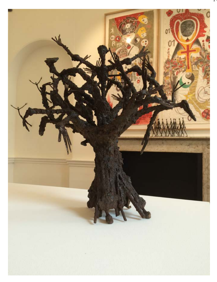
Tree of the origin . 2013 Welded steel | H50 x diam. 50 cm circa © Sitor Senghor