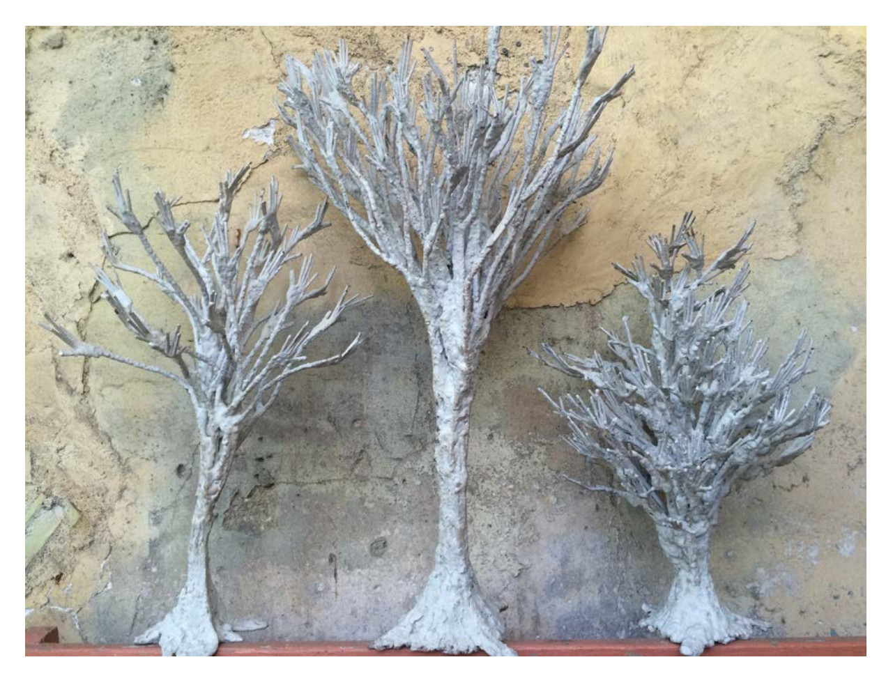
Trees of the origin . 2013-14 Welded steel | H30-55 cm © Sitor Senghor

Emblem of Senegal and omnipresent in the African collective imagination, the tree is the essential symbol of life, nature and wisdom. Giacometti and numerous modern artists were influenced by African sculpture starting from the 20s. It is now Ndary's turn to appropriate this cultural heritage and to present his own lanky and slender image in his Trees of Origins . His humanized vegetal compositions, where man draws all of his energy from the very roots of nature, are warning calls for more commitment and responsibility towards the material and spiritual environment.