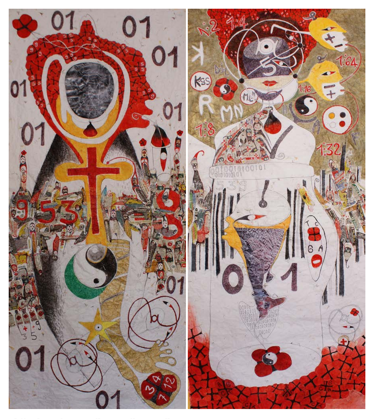
Akiineh @ t'as vu silence silence silence. 2012. Akiineh @ full pintadattitude. 2012. Drawing on creased paper | H165 x L66 cm courtesy Ernest Dükü