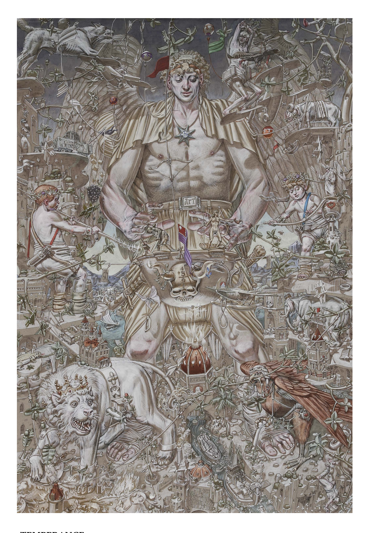
TEMPERANCE mixed media on paper, 110 x 75 cm corresponds to the letter Samekh

Letter of confinement but also of the inner life, protecting the secret