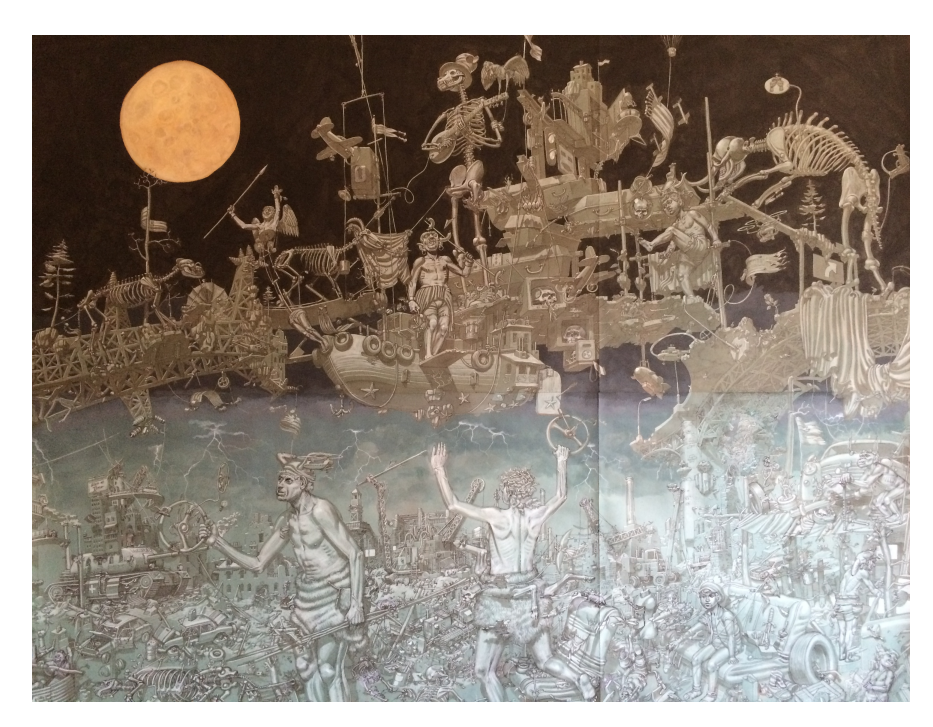
Sign of time, 2014-15 mixed media, 150 x 170 cm

One can only be delighted to discover or rediscover the fantastic allegories of the tarots, a private collection shown here as a whole, together with his latest creations. Once again it will be a great opportunity to assess the rich variety of possible interpretations this contemporary master drawer of culture has available to please our desires.