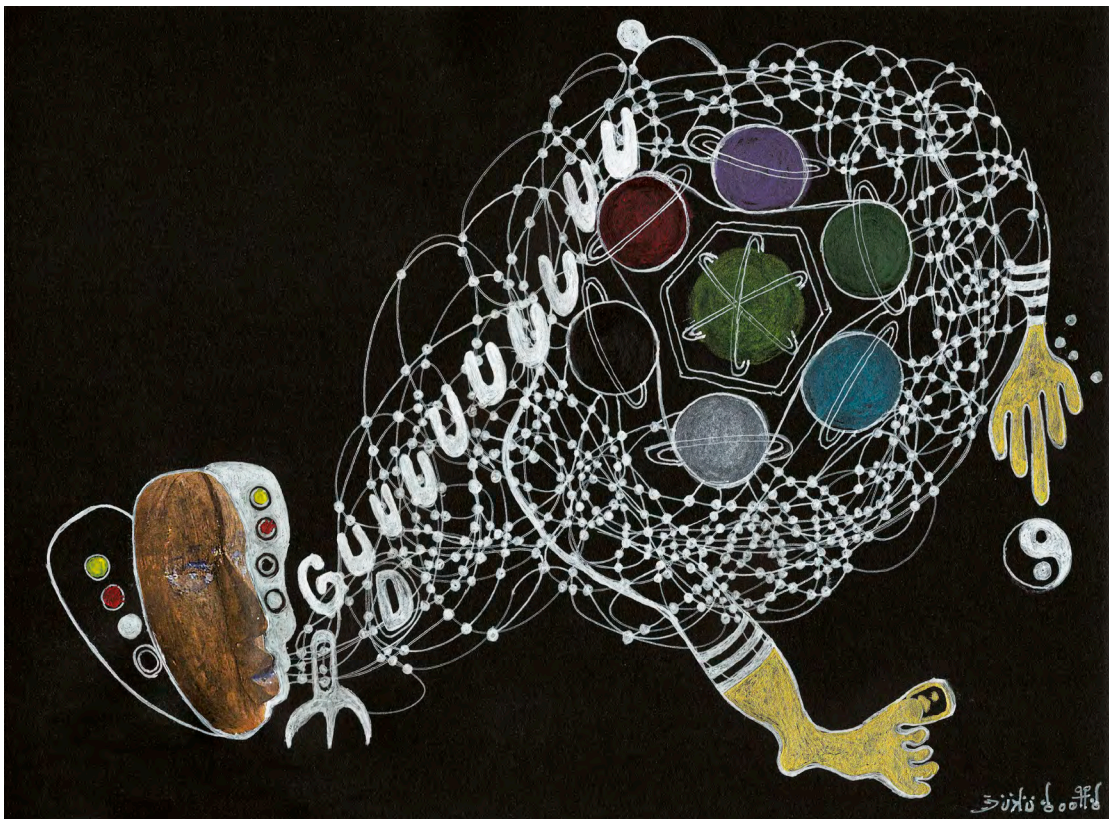
GUUUUUUUUU @ Souffle porteur odiokaawalé, 2022 Ink and acrylic on black Canson paper / 21 x 28,3 cm