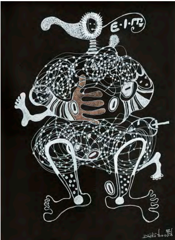
El Trône @ EIA from Sirius, 2022 Ink and acrylic on black Canson paper / 28,3 x 21 cm