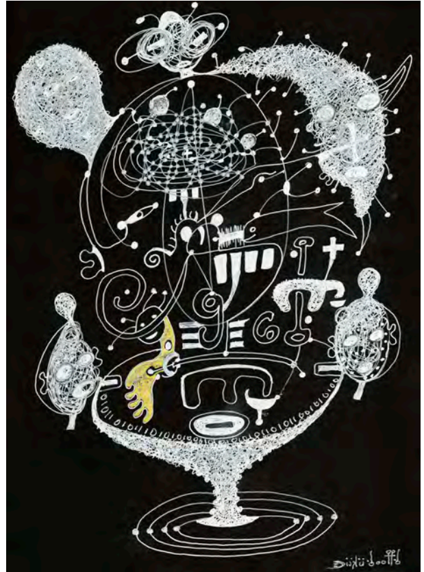
Visible invisible à l'horizon de Sirius A @ Take 1, 2022 Ink and acrylic on black Canson paper / 28,3 x 21 cm