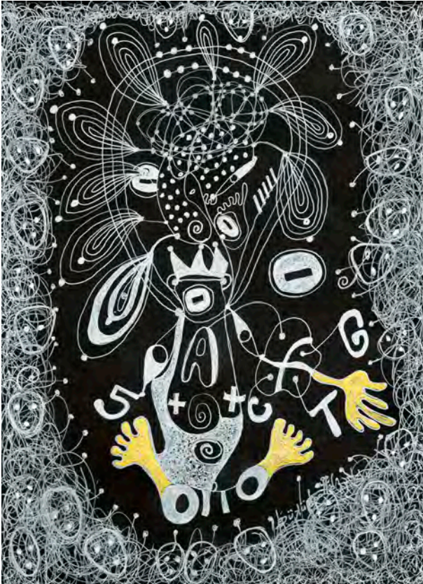
Ce n'est pas sorcier @ Juste interdit de voir, 2022 Ink and acrylic on black Canson paper / 28,3 x 21 cm