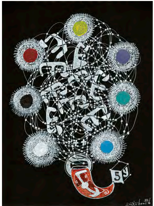
Ta GBEULY @ Cosmique Amatawale, 2022 Ink and acrylic on black Canson paper / 28,3 x 21 cm