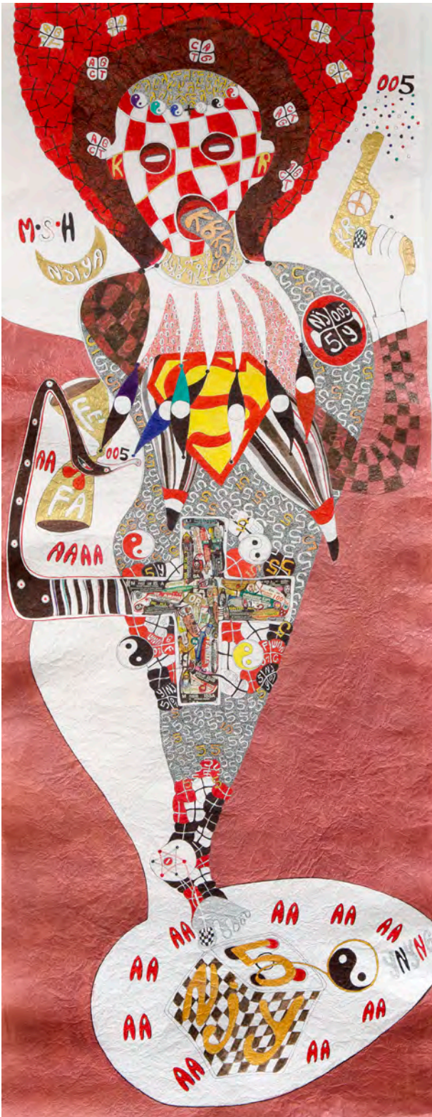
Je m'appelle ANANZE @ KAKOU ANANZE 005 code KKNNZ, 2018 Encre, acrylique, aquarelle et collage sur papier froissé 250 x 100 cm