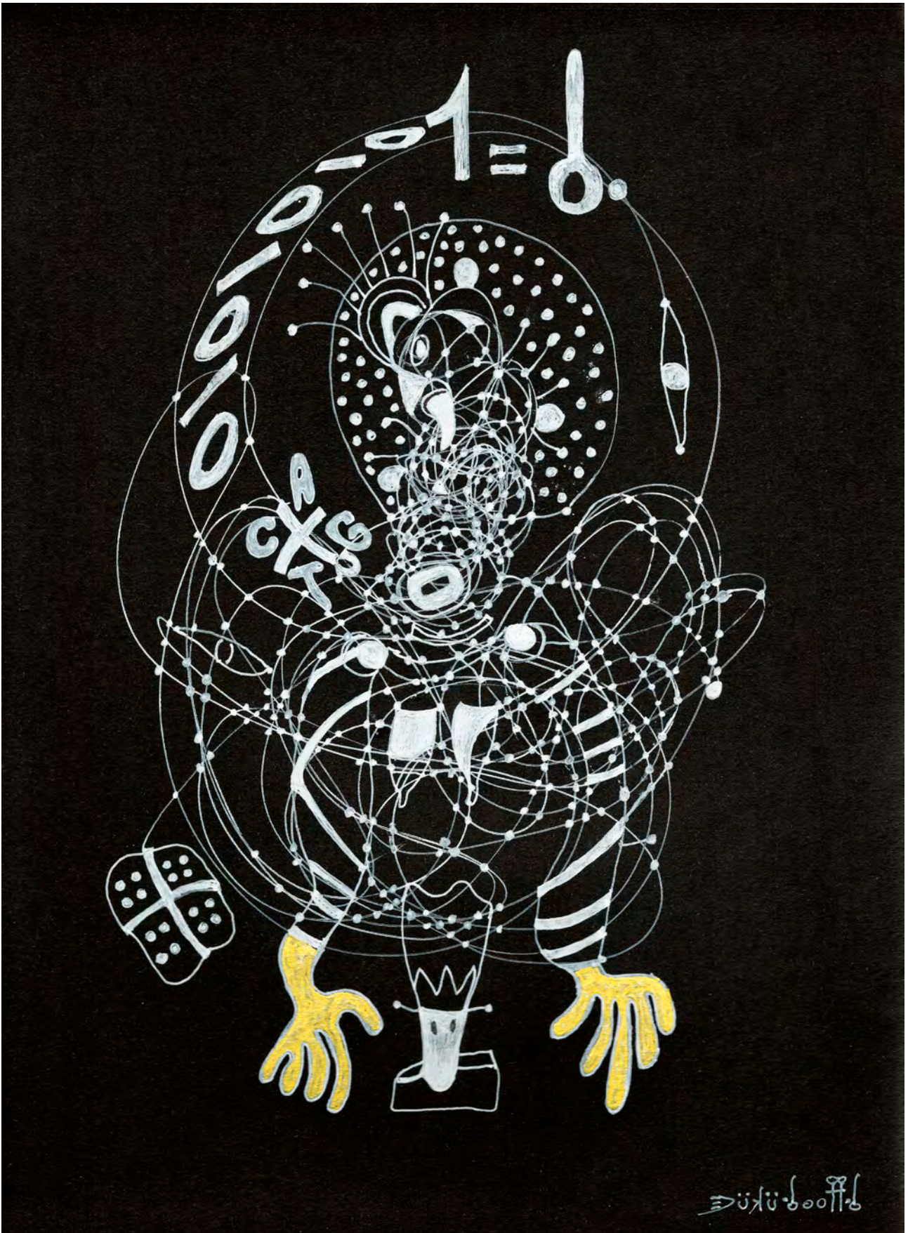
001 = 3 @ Booom naissance d'un Boson, 2022