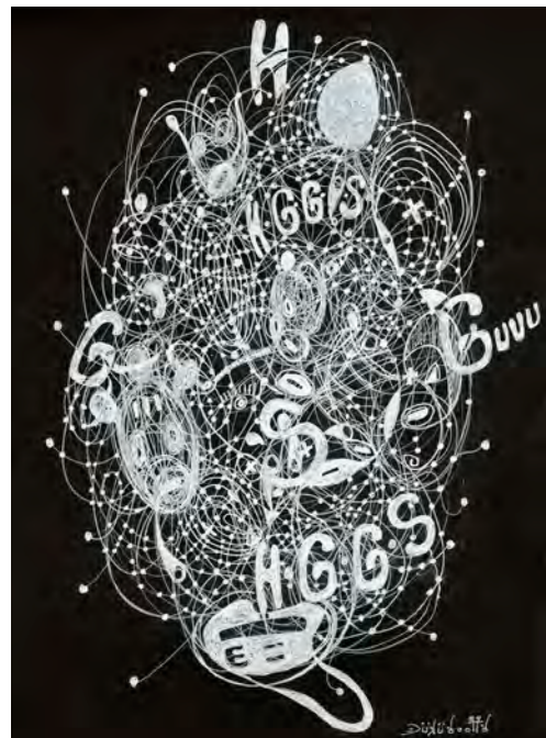
S.N.K.F @ Enigma SanKoFa Bosen, 2022 Remember GUUU @ HIGGS mouvement, 2022 Ink and acrylic on black Canson paper 28,3 x 21 cm