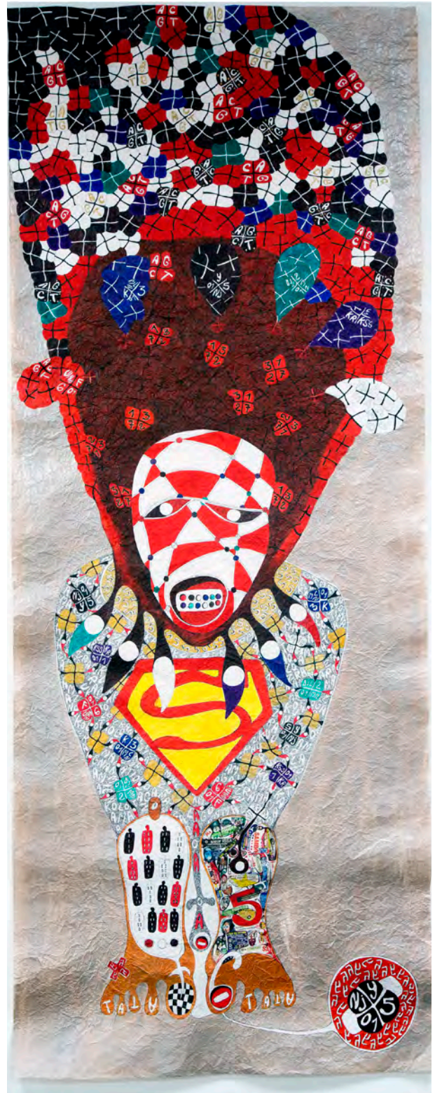
Le cri FAAWALE d'ANANZE @ 2,5,6 corpus FA cosmique?, 2018 Encre, acrylique, aquarelle et collage sur papier froissé 250 x 100 cm