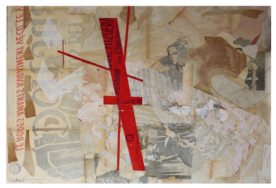
Vecchioni (2018) | H80 x L130 cm

sitor.senghor@orange.fr | +33.(0)6.11.62.01.63 | www.sitorsenghor.com