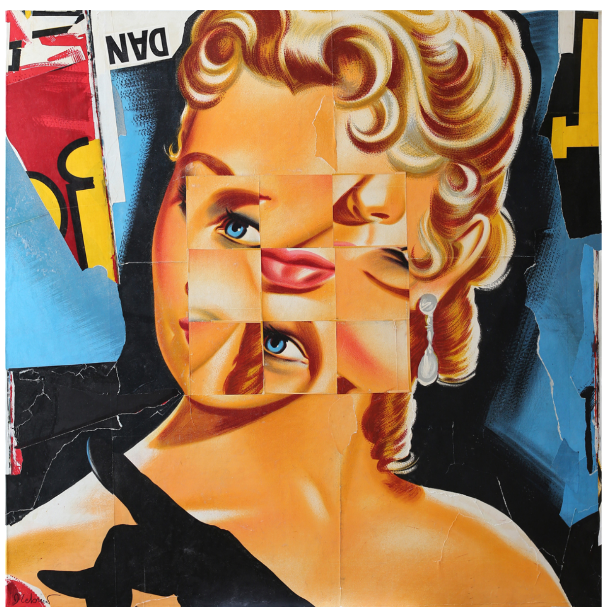
Dan (2018) | H100 x L100 cm