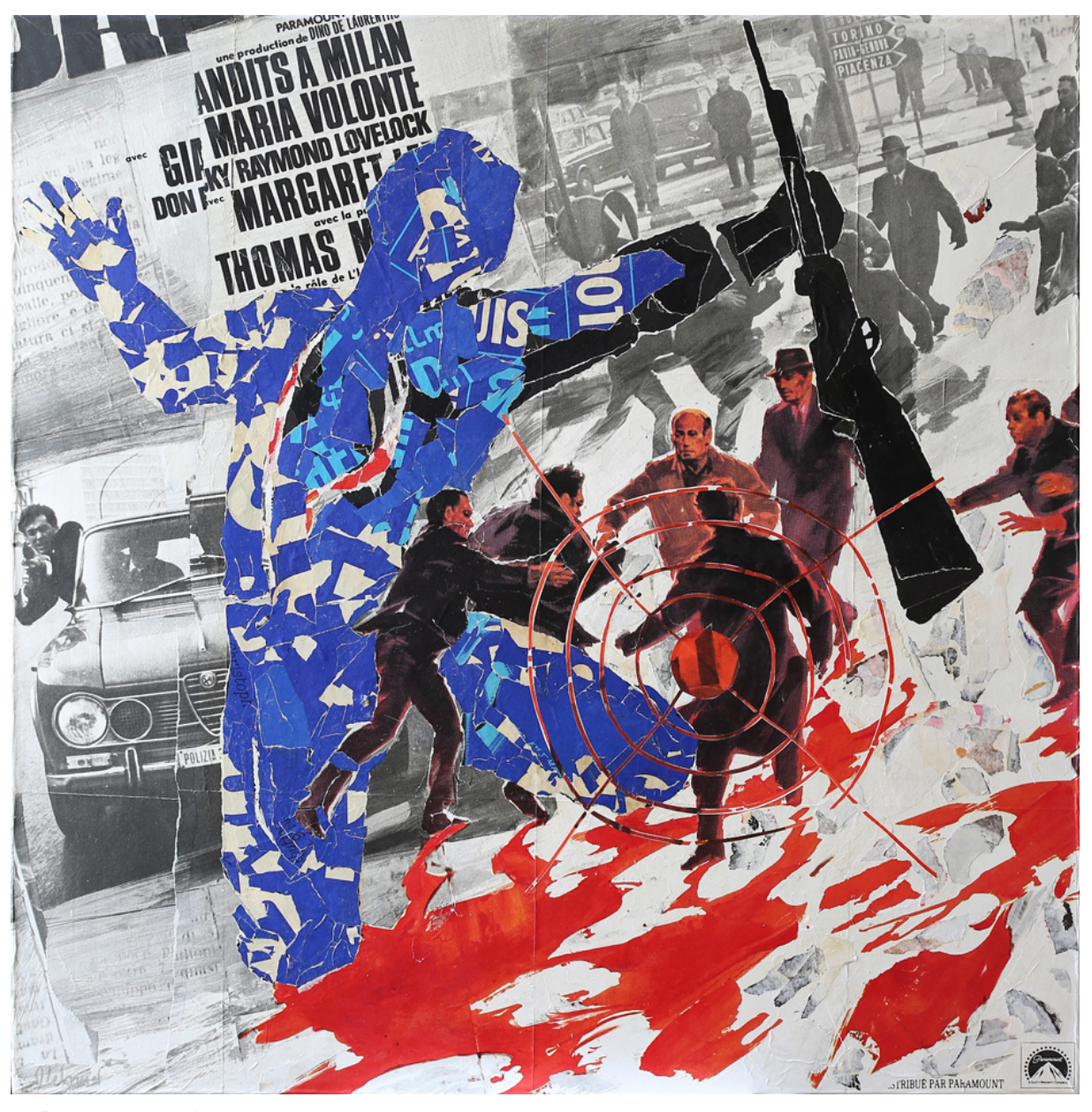
Polizia (2017) | H100 x L100 cm