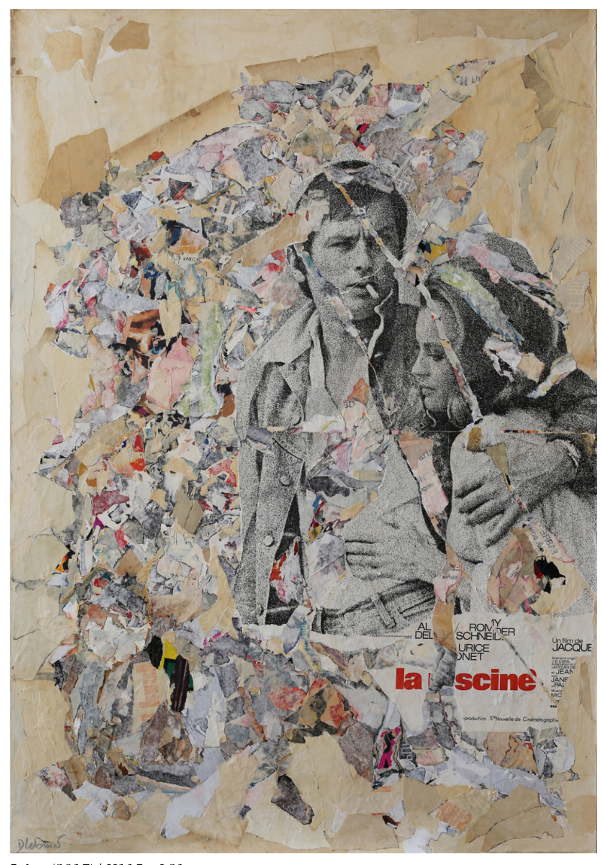
Scine (2017) | H115 x L81 cm