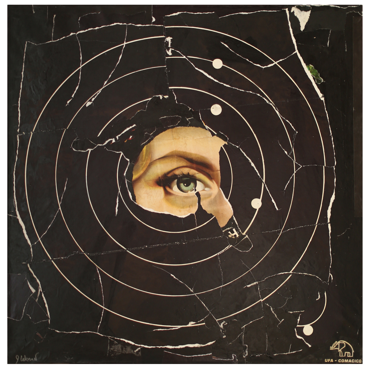
Ufa (2017) | H100 x L100 cm