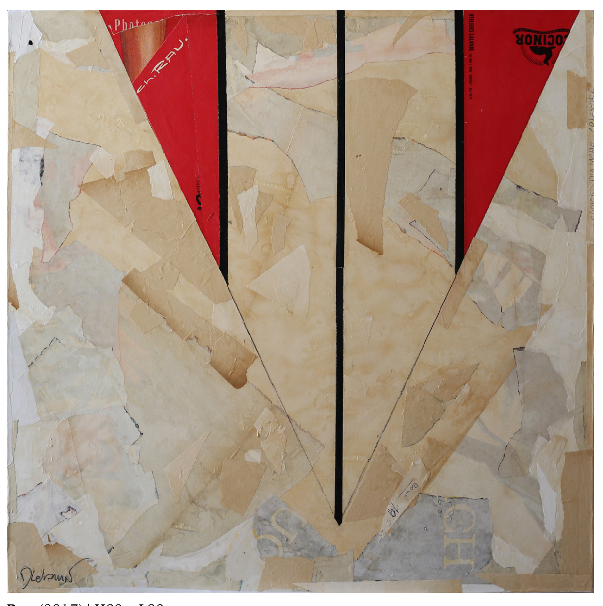
Rau (2017) | H80 x L80 cm