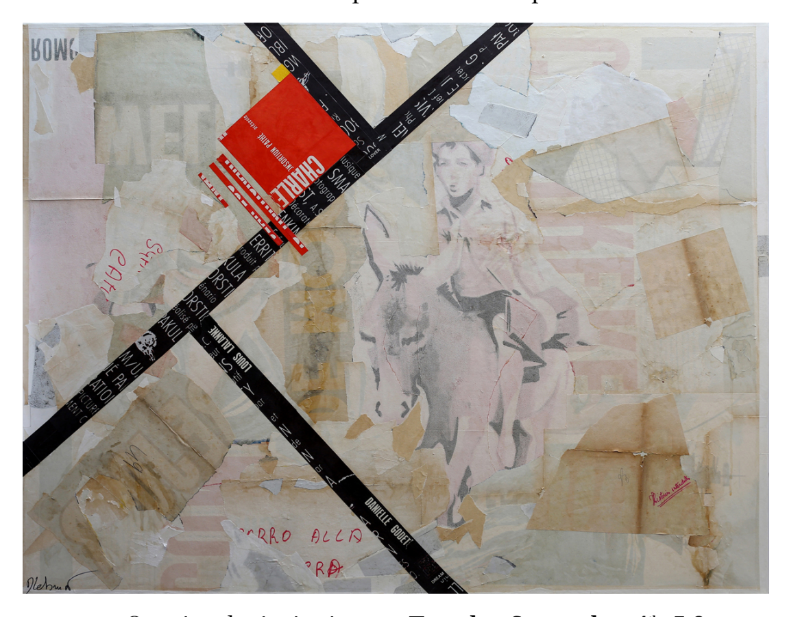
Opening, by invitation, on Tuesday September 4th, 5-9pm

Exhibition from September 4th to September 9th 2018