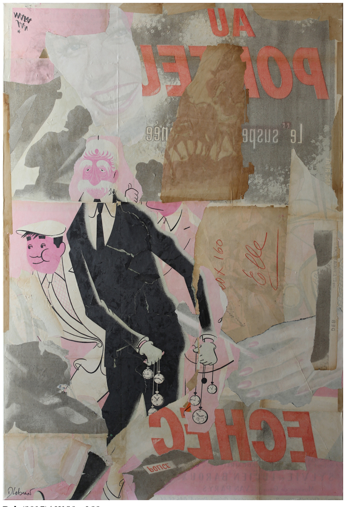
Deb (2017) | H130 x L89 cm