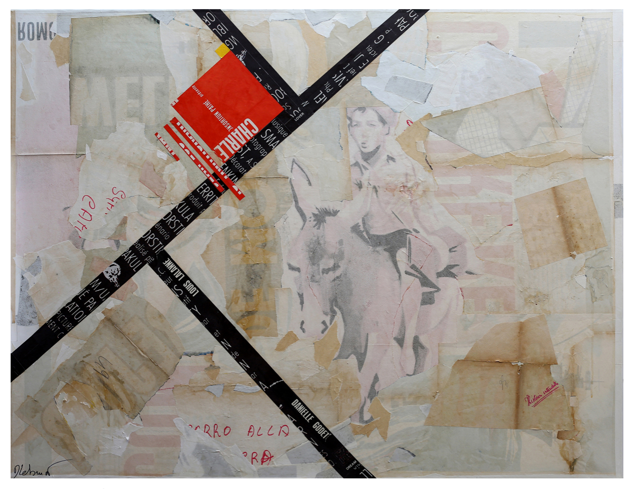
Orsti (2018) | H89 x L116 cm